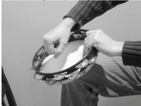
Fast-Loud Playing Position (head down)

This technique is also referred to as “hand-knee” or “fist-knee” technique. To begin, put your dominant foot (the foot on the opposite side from your holding hand) up on a chair. Now, flip your tambourine upside down and position it so that the center of the head is about 3 to 6 inches above your knee (make sure to maintain a 45-degree angle, as in the photo below). Next, make a loose fist (as in technique #1) with your dominant hand above the center of the head.