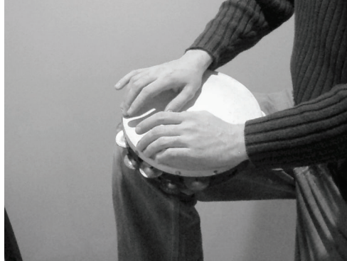
Fast-Soft playing position

Our final method of executing rhythms on the tambourine uses concepts from both Technique #2 and Technique #3. To get started, place your dominant foot on the chair again. Rest the tambourine on your leg, angled inward at 45 degrees. The holding area of the tambourine should be at the lowest point. Use the heels of your hands to pin the instrument lightly in place, so that your fingertips rest comfortably on the rim. Make sure that your hands are positioned symmetrically for an even sound. As with Slow-Soft playing, you can vary your dynamics by adding or subtracting the number of fingers used by each hand. (Try playing example #5 with this technique, at dynamic levels from pp to mp .)