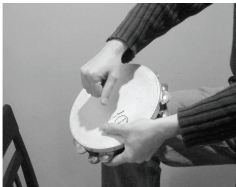
Fast-Loud playing position (head up)

While using this technique with the head facing down is an excellent way to get started, its primary drawback is that you can't flip the tambourine over in a performance without making extraneous noise. It is possible (though a little more difficult) to use fist-knee technique with the head facing up. Simply rotate your holding hand to the side of the tambourine, as in the photo below, and play as before, making sure to move the tambourine from the elbow, not the wrist. This technique will take a little more time to develop, but being able to move to and from the fist-knee position silently is well worth the effort.