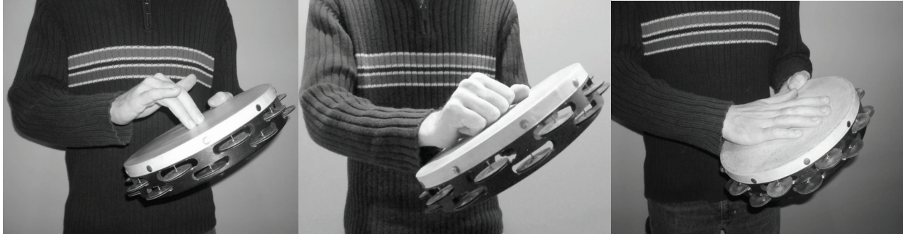
Bunched fingers ( mf-f )